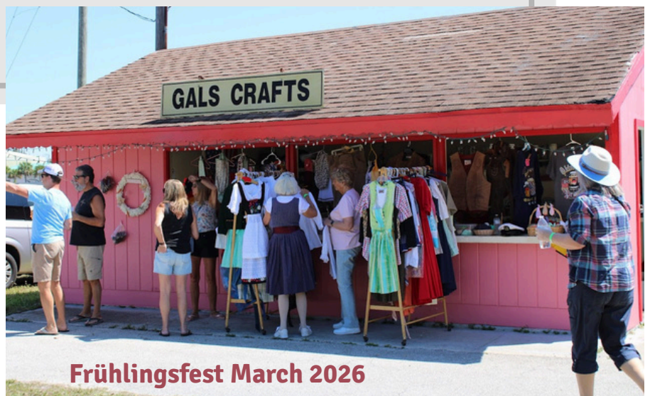
Frühlingsfest March 2026