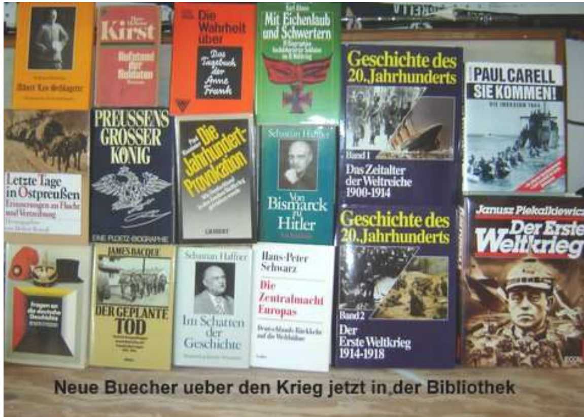
Neue Buecher ueber den Krieg jetzt in der Bibliothek